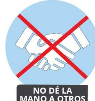
NO DÉ LA MANO A OTROS

Estornude o tosa. en un pañuelo de papel o en el codo; coloque los pañuelos usados en la basura