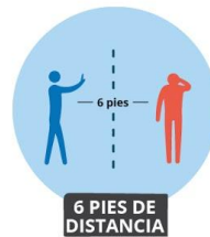
6 PIES DE DISTANCIA

Evite esta área si tiene tos o fiebre o si experimenta síntomas del virus.