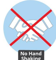
No Hand Shaking

Sneeze or cough into a tissue, or into your elbow; place used tissue in the trash